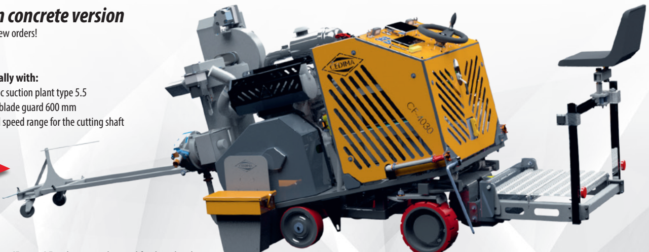
CF-4030 DF with suction plant and footboard with seat